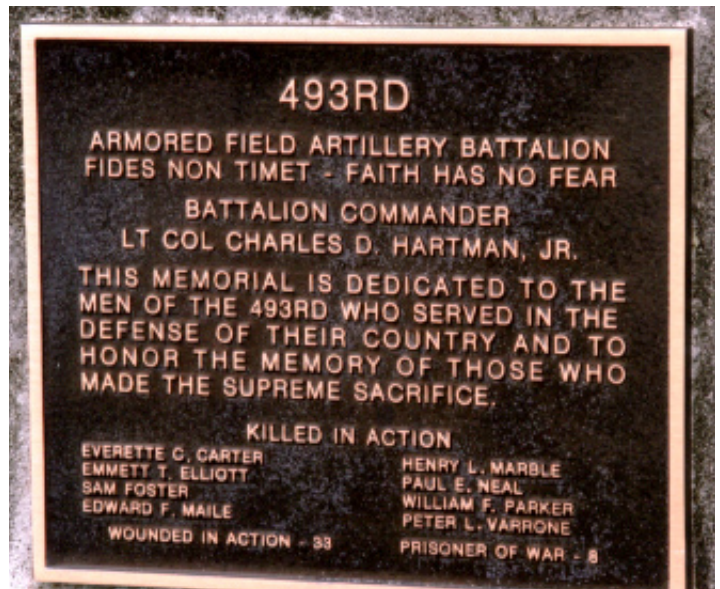
Memorial Plaque listing KIA's and other info

Don't Delay get your reservation for the Reunion Today Call the Gold Coast Hotel and Casino. We will be turning back rooms September 6th so get your Reservation ASAP. Reservations after the 6th are on an if available basis and possibly at a higher cost.