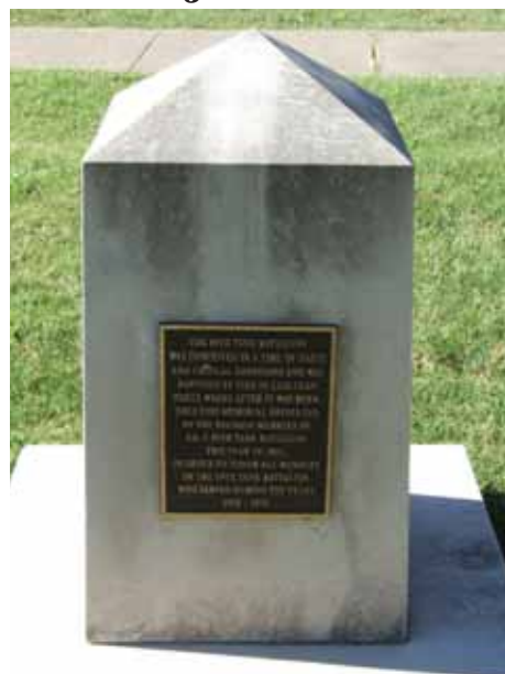
Sample monument At The Armor Memorial Park